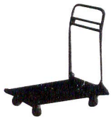
A. Figure of the platform carrier.