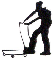
B. Step down the lock.